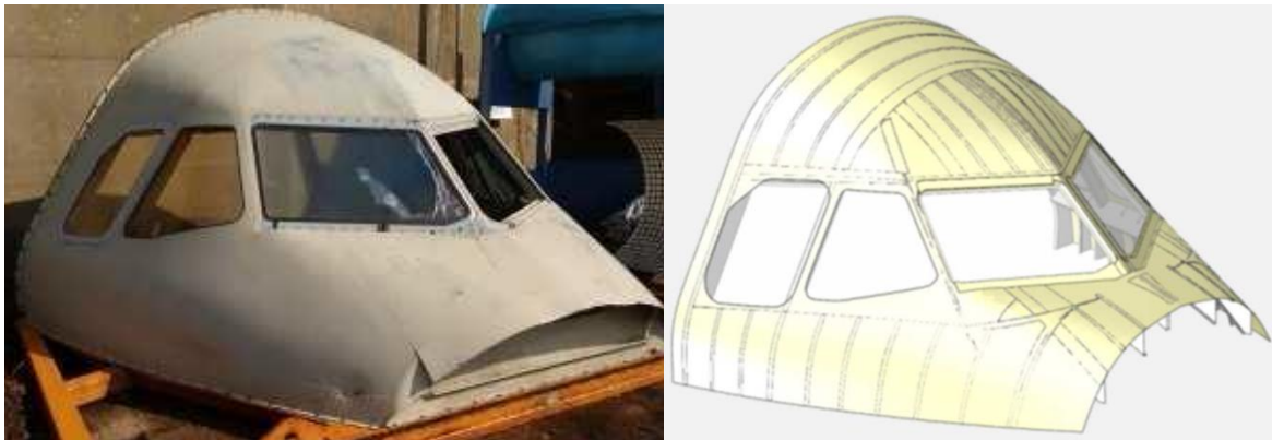
Figure 1: Airliner cockpit for impact testing (left) and computer reference model